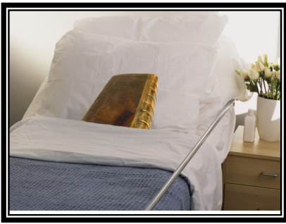
Book Has Appendix Removed