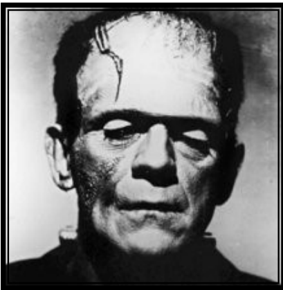
Frankenstein Afraid of fire, Dying alone