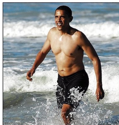
Obama trying to stimulate economy

With unemployment the highest it’s been since the great depression, and the National Deficit rising daily, President Obama has resorted to more unconventional methods of stimulating the economy. At a recent press conference, Obama appeared in a thong and feather boa, and was quoted as saying, “Ooh, how do you like that, Economy? I’m gonna Barack you all fiscal year long!” During the press conference, a journalist asked “Isn’t this just a sophomoric play on the word stimulus package?” to which Obama replied, “I got your stimulus package right here honey!” Other steps the President has taken include covering the Lincoln Bedroom in rose petals and issuing emergency rations of body chocolate to the nation, Obama has also looked to previous presidents for help, with President Clinton serenading the economy with a sensuous saxophone solo, and the two Bushes staring in