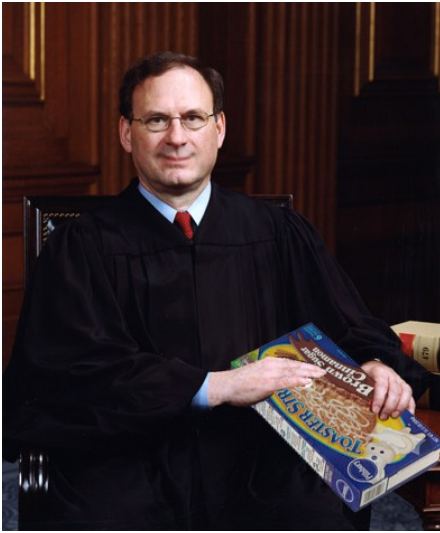
Souter with his favorite flavor, Brown Sugar Cinnamon

In one of the slowest judiciary sessions in American history, the U.S. Supreme Court has discovered that Toaster Strudels apparently violate several constitutional amendments. “We were just chillin’ there,” says Chief Justice Roberts, “Breyer and Scalia were playing a bipartisan game of