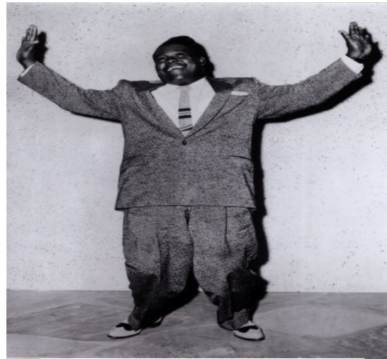
Fats Domino, celebrating the discovery of a Twinkie behind the podium

ers at Men's Warehouse. Fats Domino, Head of the National Association to Advance Fat Acceptance and noted domino enthusiast, has expressed his outrage at a recent press conference, stating "Now, the mainstream Americans will try and coax us into leaving with garbage bags full of popcorn. Delicious, hot, buttery popcorn. But we can't let them- I have to go." Mr. Domino was found 3 days later, having taken a Pop Secret factory hostage.