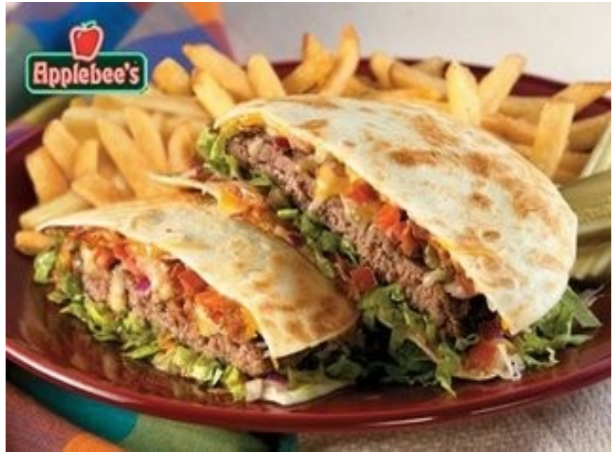
The Quesadilla Burger, Applebee's most popular and confusing item