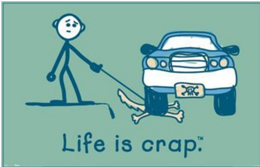
The last drawing lapin made